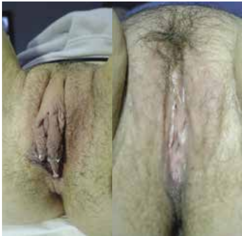
Figure 1: 32-year-old 2g/2p with labial hypertrophy, vaginal laxity and SUI grade 1. Laser labioplasty and clitoral hood reduction was performed six weeks before three sessions of CO 2 RE Intima treatment were applied. Full patient satisfaction was achieved.